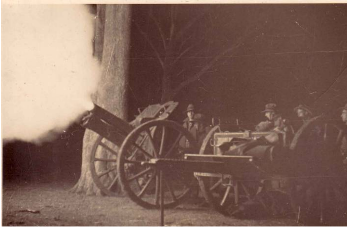
107 th (H) Bty Firing at night, Rutherford Sept 1939