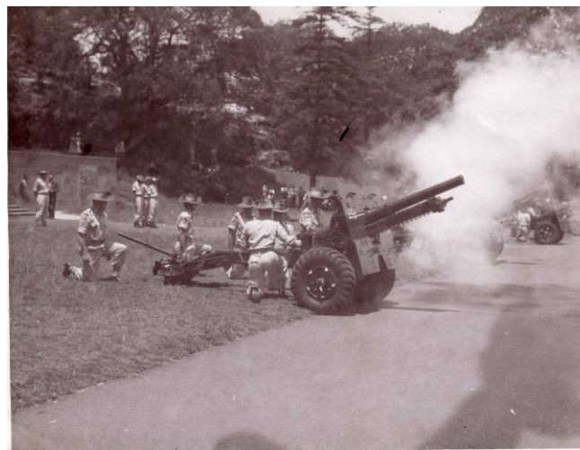
The Regiment Firing the Australia Day Salute at the Domain, January 1958