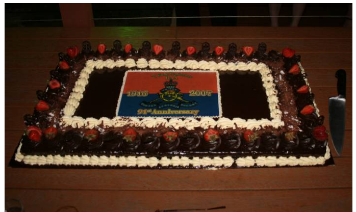
The Regiments 91 st Anniversary Cake