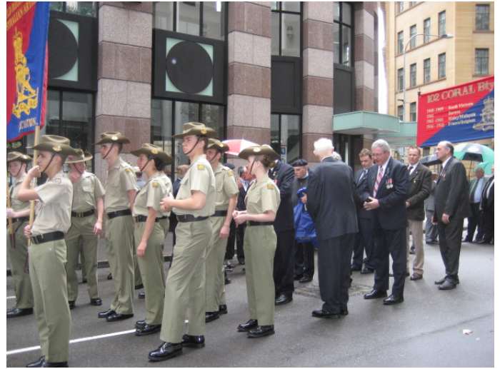
“Hurry up and wait” Both past and present members of the Regiment wait for the march to start