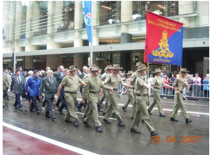
Members of the Regiment proudly marching the Association banner