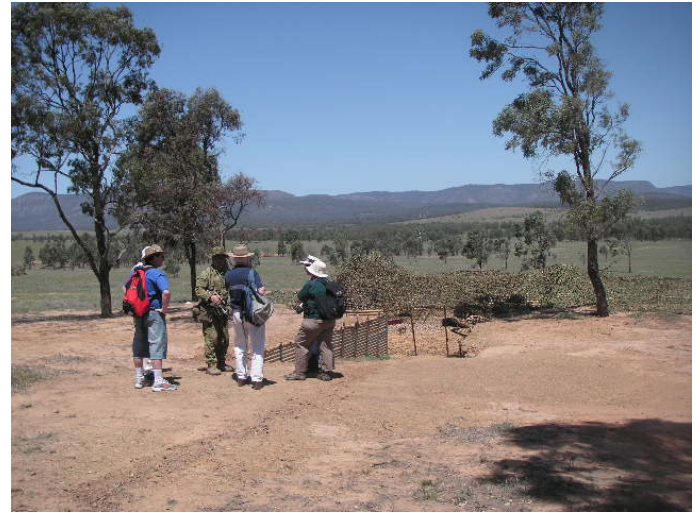
Members enjoying a mouthful a Singo dust