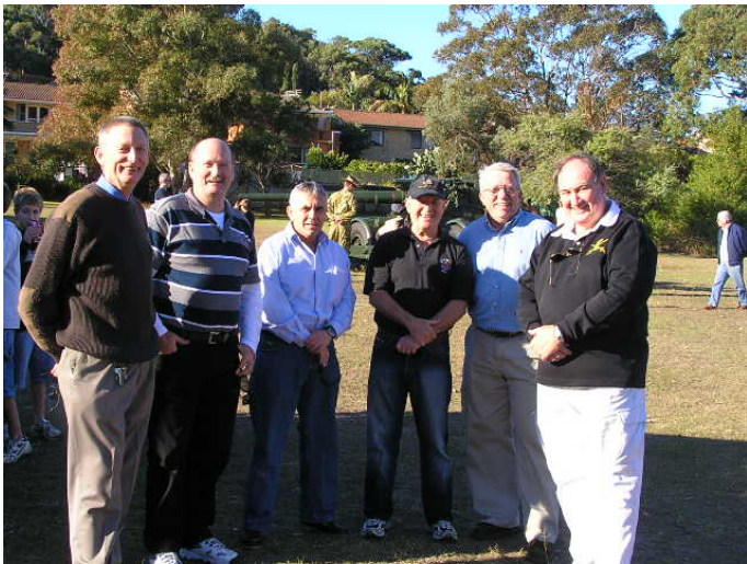
50 th Anniversary of the Opening of Dee Why 24 Jun 06