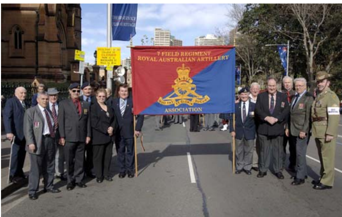
Reserve Forces Day 2 Jul 2006