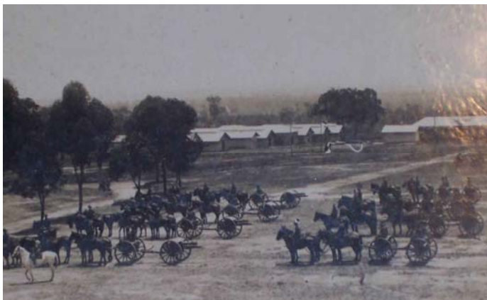
27 Bty on Parade at their 1925 Holsworthy AFX