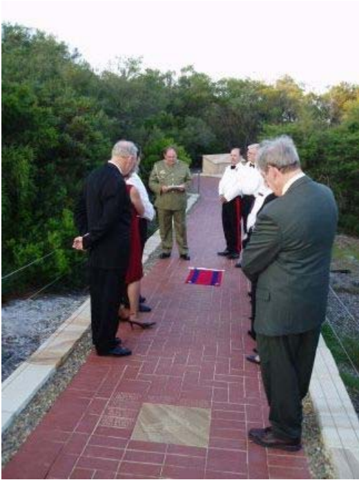
The Dedication of The Regimental Paver at North Fort Museum