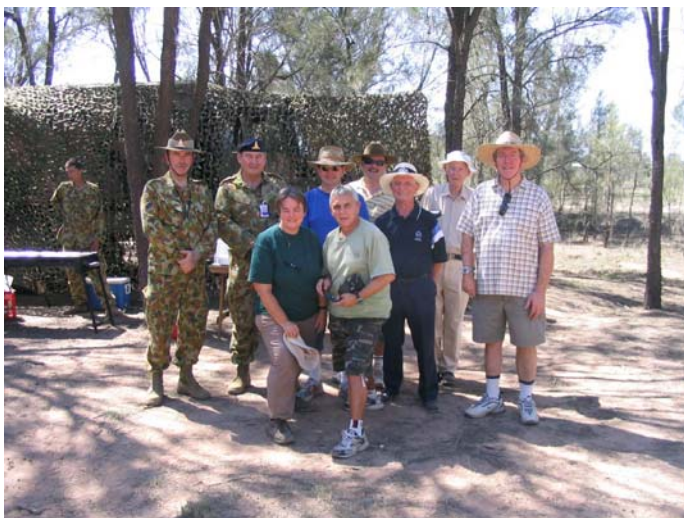
7 Fd Association members at the LFX 14 Oct 06

However that did not stop us dreaming of a good wiff of the cordite smoke to bring back those fond memories or the nightmares of your No 1 or Seco.