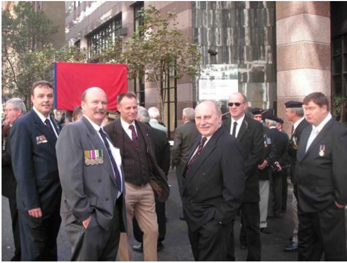
Anzac Day 2006

It would be great to see the all of the Association proudly wearing their new medal at next years Anzac and Reserve Forces Day Parades.